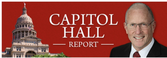
Why Texas Elections are Not Safe or Secure

The lack of accuracy, transparency and accountability in the current Texas election process means it would be impossible to present sufficient evidence in a court of law to prove that anyone elected to public office was actually the intent of the majority of those who voted in their election.